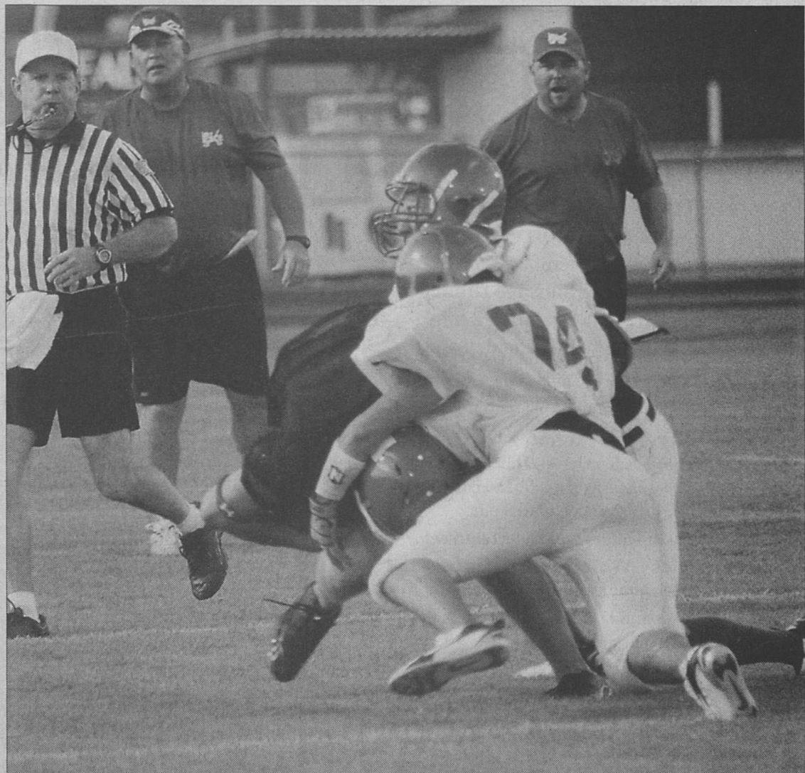
The Raider defense takes down a Cardinal runner.

Colorado County will hold a public hearing on the Colorado County 2008 Budget at the Regular Term of Commissioners Court on September 10, 2007 , at 9:10 a.m., at the Courthouse, County Courtroom in Columbus, Texas. This Proposed Budget will raise more total property taxes than last year's budget by $674,172 dollars or 11.93%, and of that amount $117,728 is tax revenue to be raised from new property added to the tax roll this year. The proposed 2008 Budget is on file in the County Clerk's office at the County Courthouse, Columbus, Texas, and is posted on the County's website ( www.co.colorado.tx.us ) under Public Notices for public viewing.